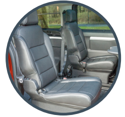
Second row seating - leather upholstery available as an option.