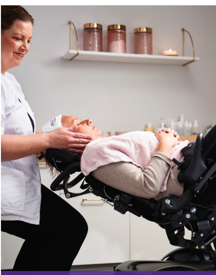
Power recline, 85-135°, redistributes pressure for increased comfort and sitting tolerance.