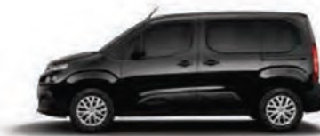
Perla Nera Black