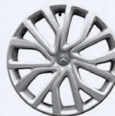
16" 'Twirl' Wheel Trim Standard on Feel