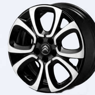
17" "Spin" Wheel Trim Standard on Flair XTR