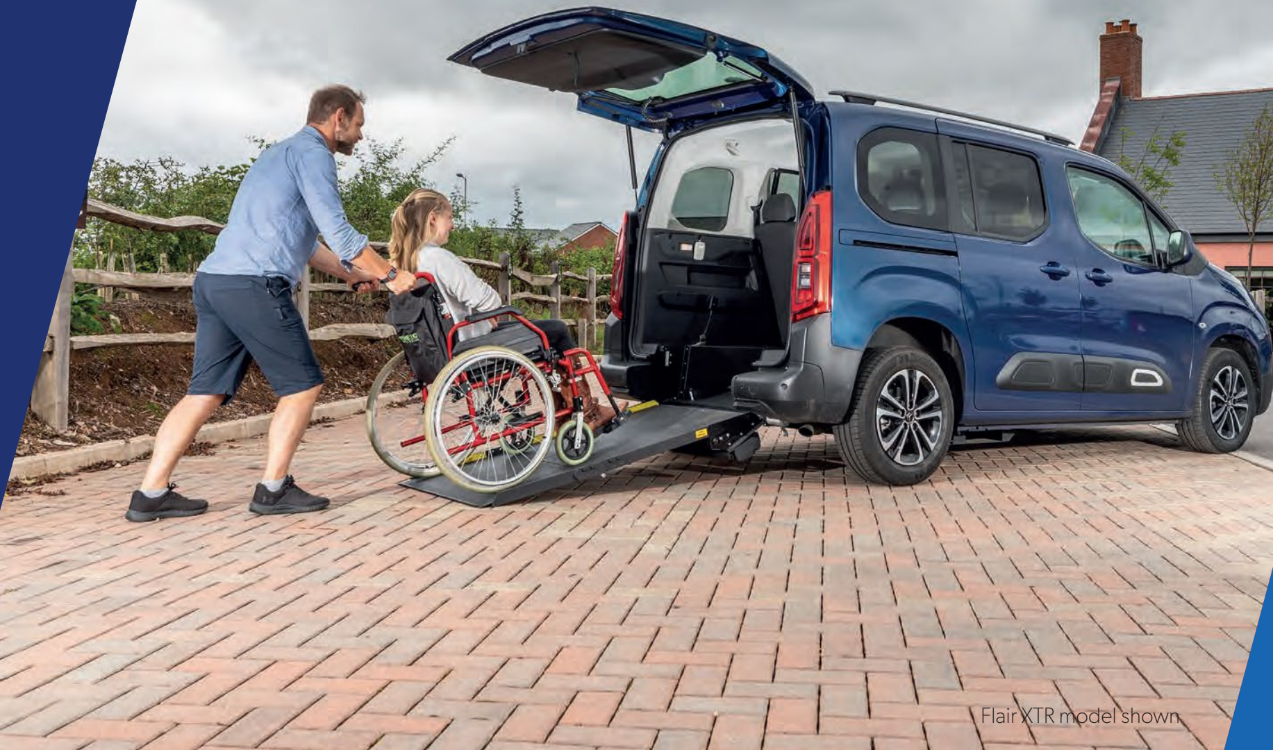
Flair XTR model shown