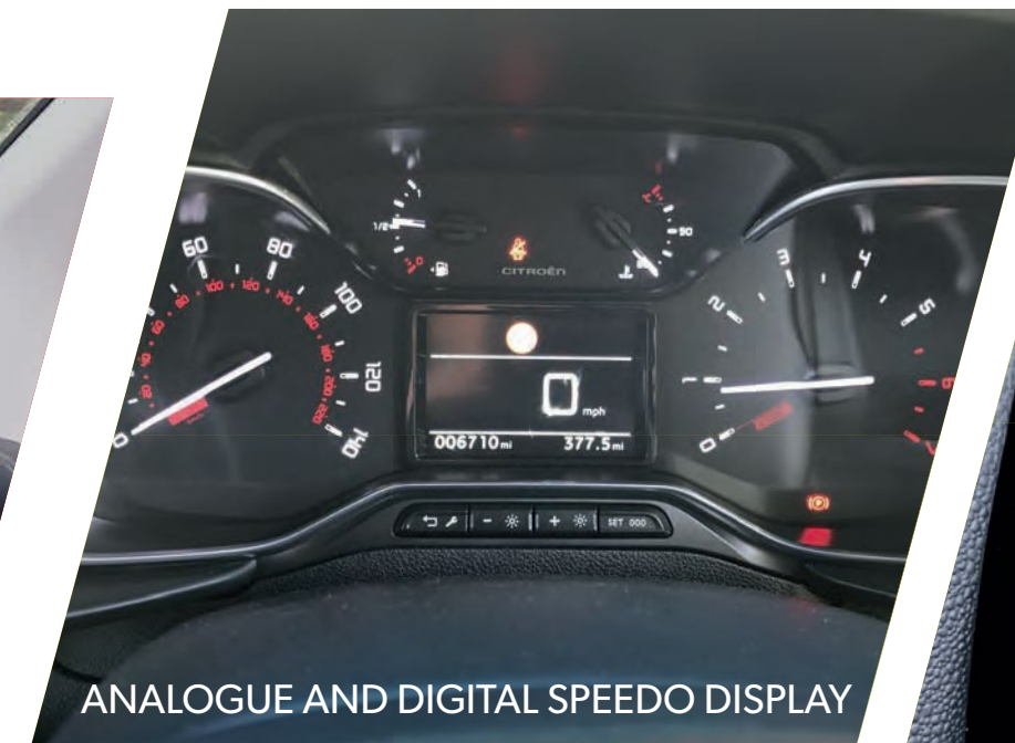
ANALOGUE AND DIGITAL SPEEDO DISPLAY