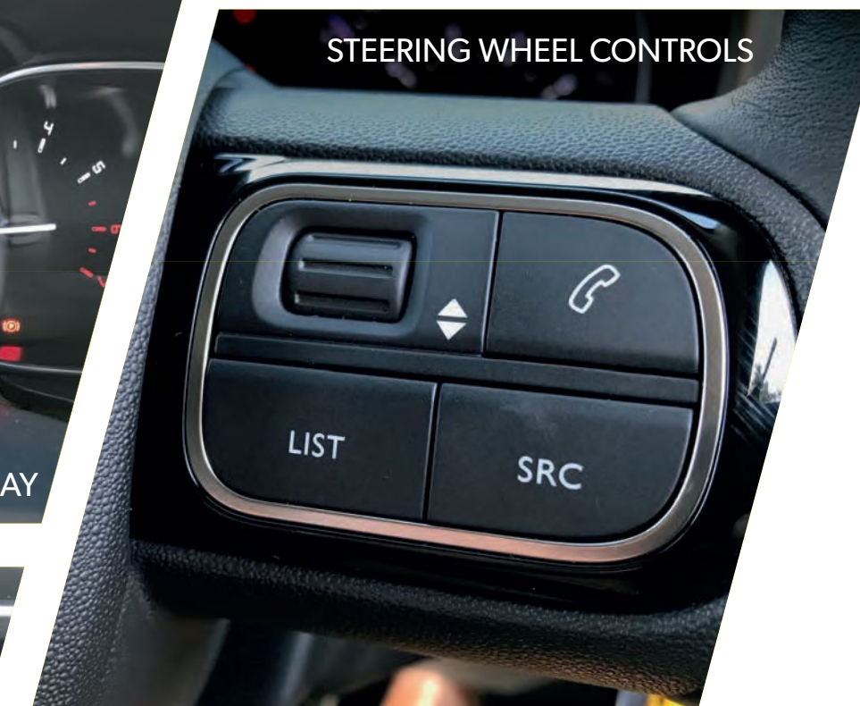
STEERING WHEEL CONTROLS