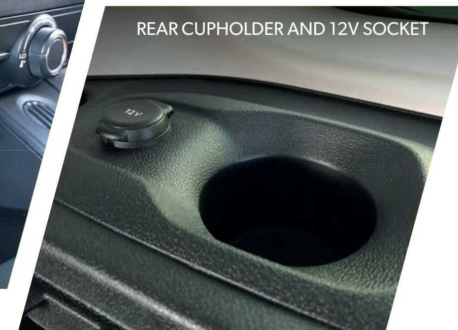
REAR CUPHOLDER AND 12V SOCKET