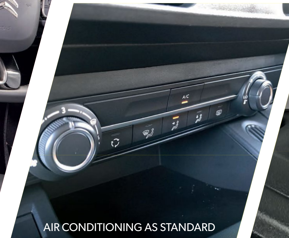
AIR CONDITIONING AS STANDARD