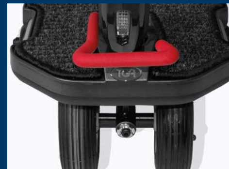
Easy lifting handle