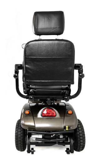
Unique suspension system