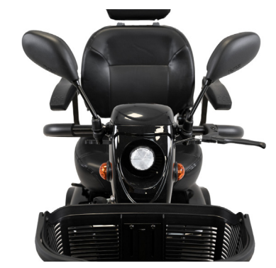
Deluxe adjustable captain seat