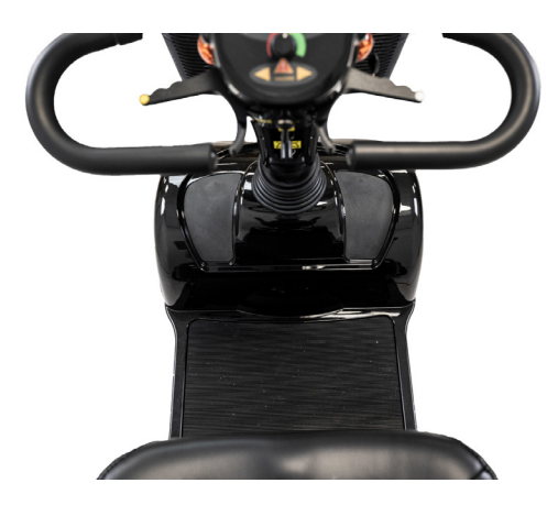
Easy to use delta handlebar